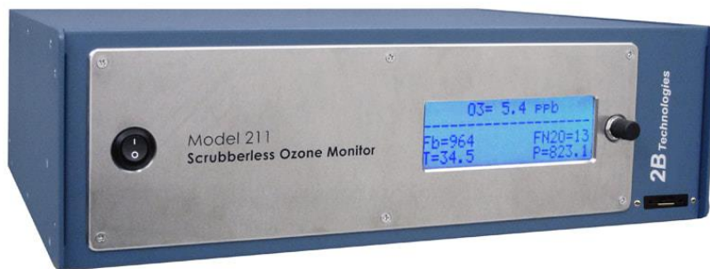
The Model 211 Scrubberless Ozone Monitor

The 2B Tech Instrument's Role: The Model 211 was used to make ozone measurements during the UWFPS. Low ozone concentrations characteristic of wintertime combined with potential positive interferences from VOCs made having an interference-free ozone measurement crucial toward gaining an understanding of ozone behavior in the Cache Valley. The capability of the Model 211 to provide interference-free ozone measurements along with its FEM designation made it the ideal instrument to measure ozone as part of the study.