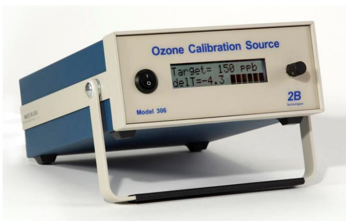
The Model 306 Ozone Calibration Source

The 2B Tech Instrument's Role: The Model 306 was used as one of the ozone generators during the study. The calibrator's ability to generate either zero air, or air with ozone in the range of 30 to 1000 ppb, allowed the researchers to have a device capable of treating both the control group (no ozone exposure) as well as the group exposed to ozone. The stable output of the Model 306 ensured that the skin samples inside the Plexiglas chamber received constant airflow that either contained zero air or air with a steady concentration of 0.4 ppm of ozone. The small size and portability of the Model 306 made for easy deployment of an ozone generator in a lab-based setting.