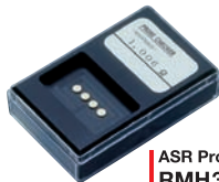
ASR Probe checker RMH304

*Probes for Loresta GX cannot be connected to Loresta GXII