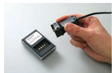
● Check the probe with Probe Checker prior to measurement.

*Specifications and appearance are subject to change without prior notice.