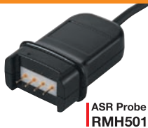
ASR Probe RMH501