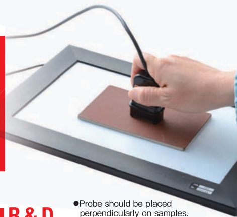
● Probe should be placed perpendicularly on samples.