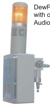
DewPatrol with optional Audio Visual Alarm