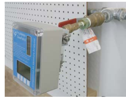
Mounted directly on quick connect outlet