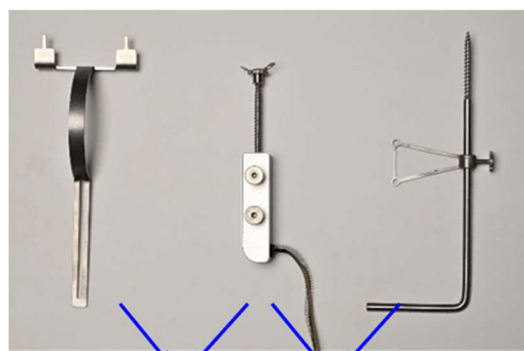
Combi Dendrometer DD-S2/DR7