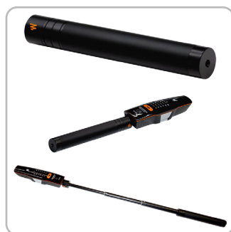
WaveStick Part # WWMA0002

Adjustable extension stick (73 cm / 28,74 ")