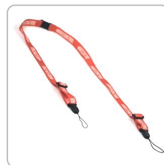
WaveMon Lanyard Part # WWMA0003