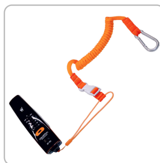
Safety cable Part # WWMA0001

Adjustable extension stick (73 cm / 28,74 ")