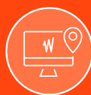
Electromagnetic Mapping Software