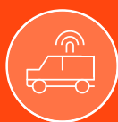
MonitEM on Vehicle