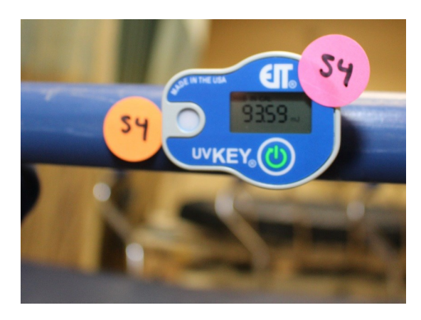
The EIT UVKey can be used to easily confirm the numerical dose value of UVC in an operating room (left) and in high touch patient areas such as a bed rail (above)