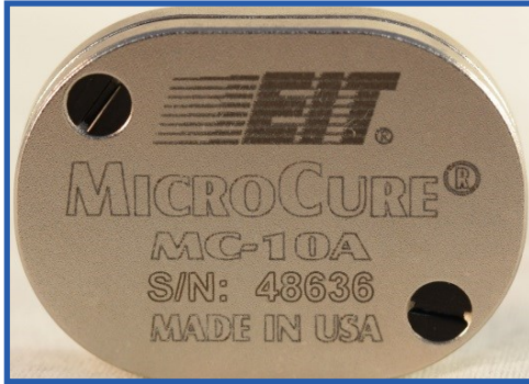
Actual size: 1.3" x 0.95" x 0.25"